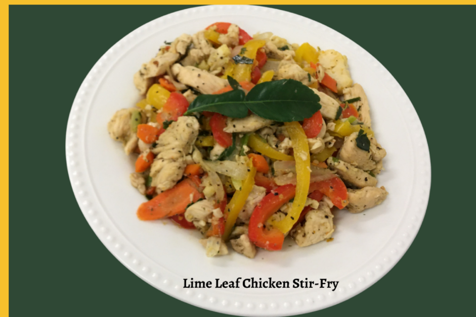
Lime Leaf Chicken Stir-Fry